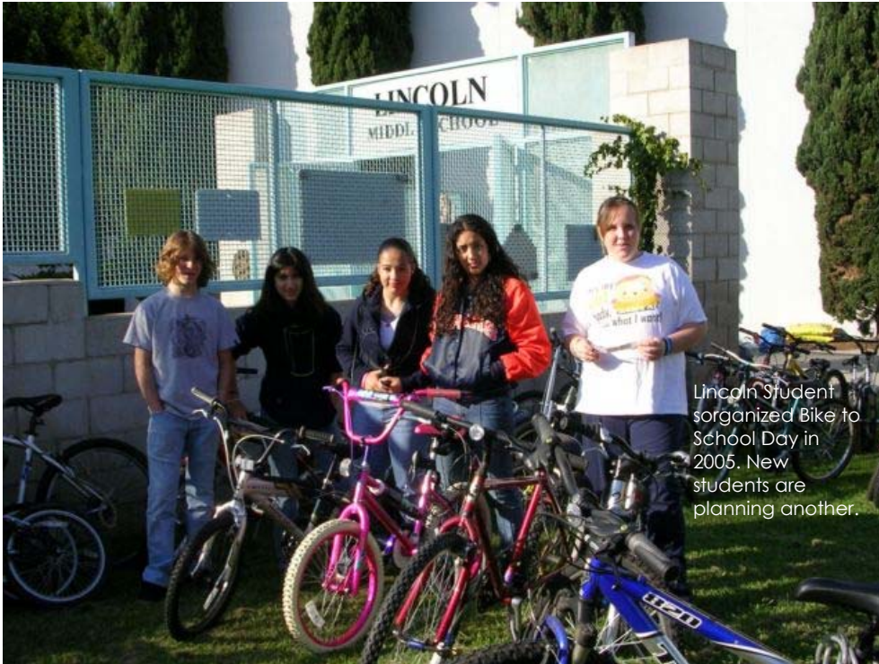
Lincoln Student organized Bike to School Day in 2005. New students are planning another.